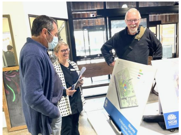
Chatting to community members at the local IGA