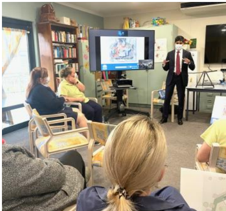
Discussing the master plan with the local staff