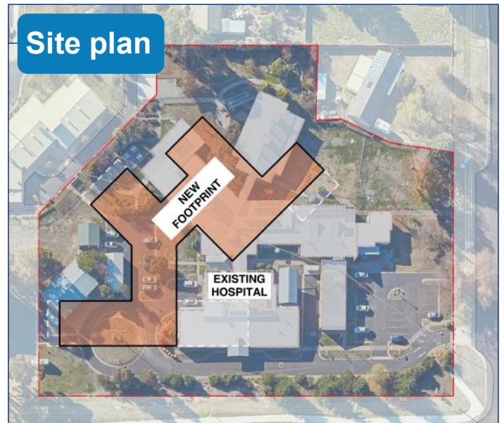
Above: The site master plan shows the footprint of the new facility.

For more information, visit our website at www.mps.health.nsw.gov.au or google 'Blayney MPS'.