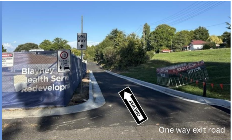
One way exit road