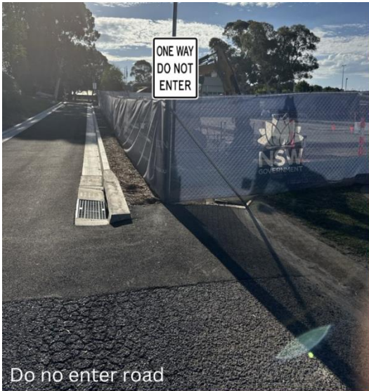
Do no enter road