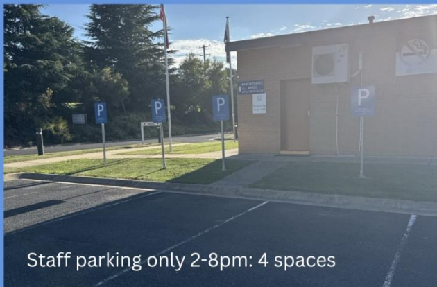
Staff parking only 2-8pm: 4 spaces