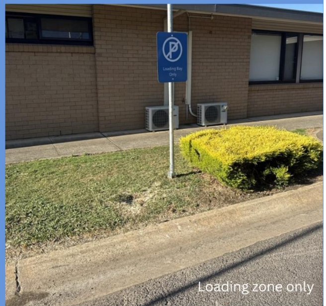
Loading zone only

The new MPS is being built in stages to ensure as little disruption as possible to the provision of clinical services.