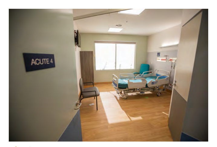
Acute care room.