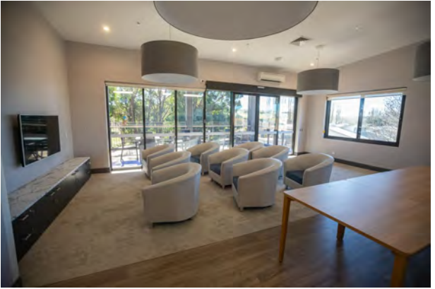
One of the residents' lounges in the Residential Aged Care facility at the new Braidwood MPS.