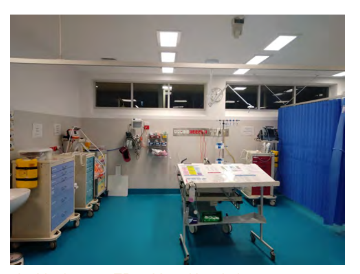
Inside the new ED at Yass Hospital.

Construction works are carefully staged to ensure all hospital services are maintained during the construction period and operations are not impacted.