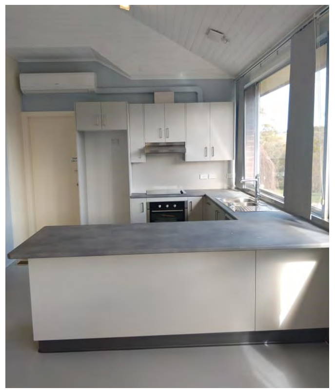
The new kitchen at Crookwell Hospital Wellness Centre.

The ED plans are being finalised to ensure compliance with building and fire standards. The construction tender process will commence soon with an anticipated construction commencement date for these works in early 2021.