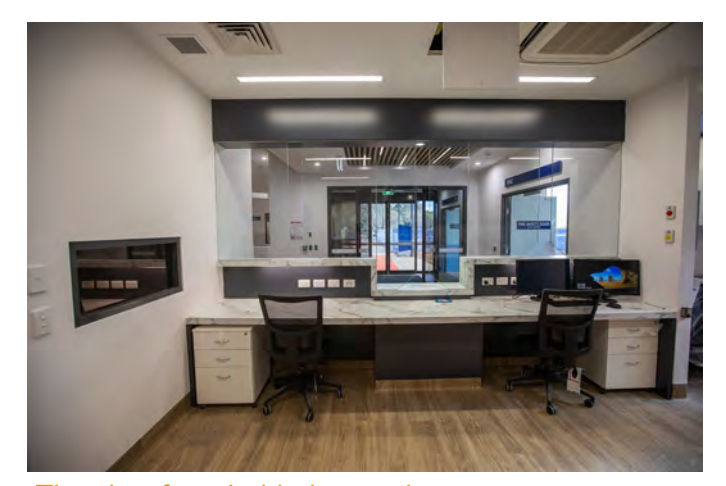
The view from behind reception.