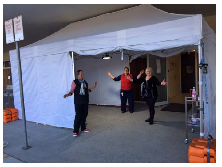
Bega free COVID testing clinic

It is OK to get tested more than once, if you have symptoms at different points in time.