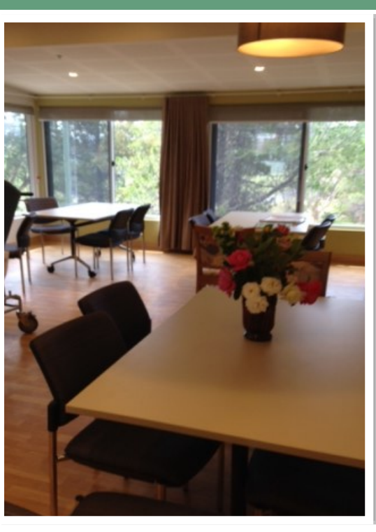
Residential Aged Care Dining and Activity room