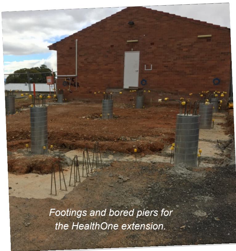
Footings and bored piers for the HealthOne extension.