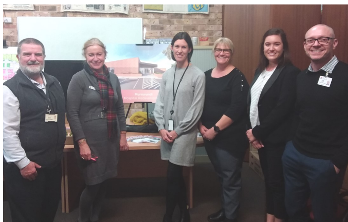
Community consultation held in July 2019

This represents an increase in primary and ambulatory care services, emergency services, and new staff accommodation facilities.