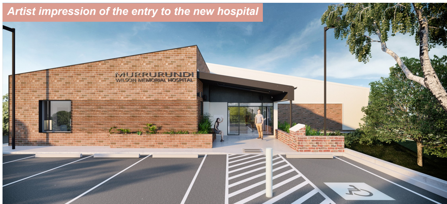
Artist impression of the entry to the new hospital

Where to next? The construction contract is scheduled to be awarded in late 2019 with work to commence soon after.