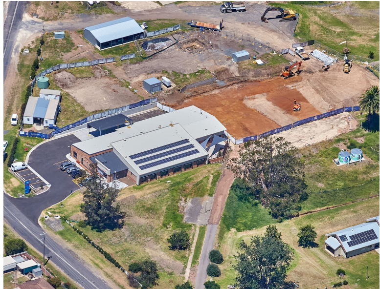
Aerial photograph of the hospital site in late January 2021

We are still planning on holding a community event to welcome the new hospital and celebrate the completion of the project around mid-year. The community event will be in line with the health guidelines and restrictions that are in place at the time, and we will release the details of this community event closer to the time. Thanks for your ongoing patience and support.