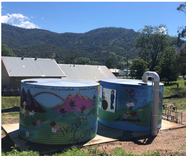
Images inspired by students painted onto new water tanks

Welcome artwork has been installed in the new hospital's entry area, and local photography is being framed for display in the two patient corridors. Heritage information boards are also being manufactured and will be installed at the entrance to the new hospital. We look forward to providing more detail on these important pieces.