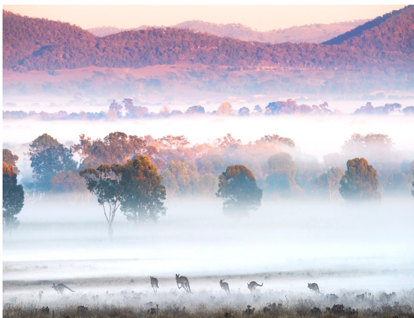
Local photography was installed in the new Mudgee Hospital as part of the Arts in Health initiative

Physical photos can be reproduced so you can keep your precious memories.