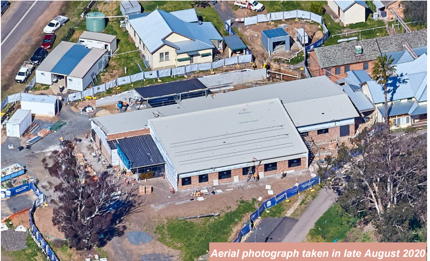
Aerial photograph taken in late August 2020