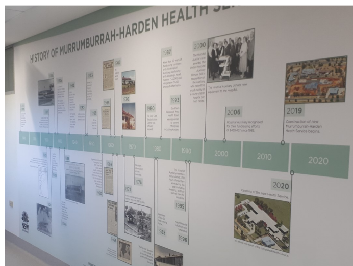
Example of a historical timeline installed in the Murrumburrah-Harden Health Service

We look forward to working with local artists to create beautiful artwork for the new hospital.