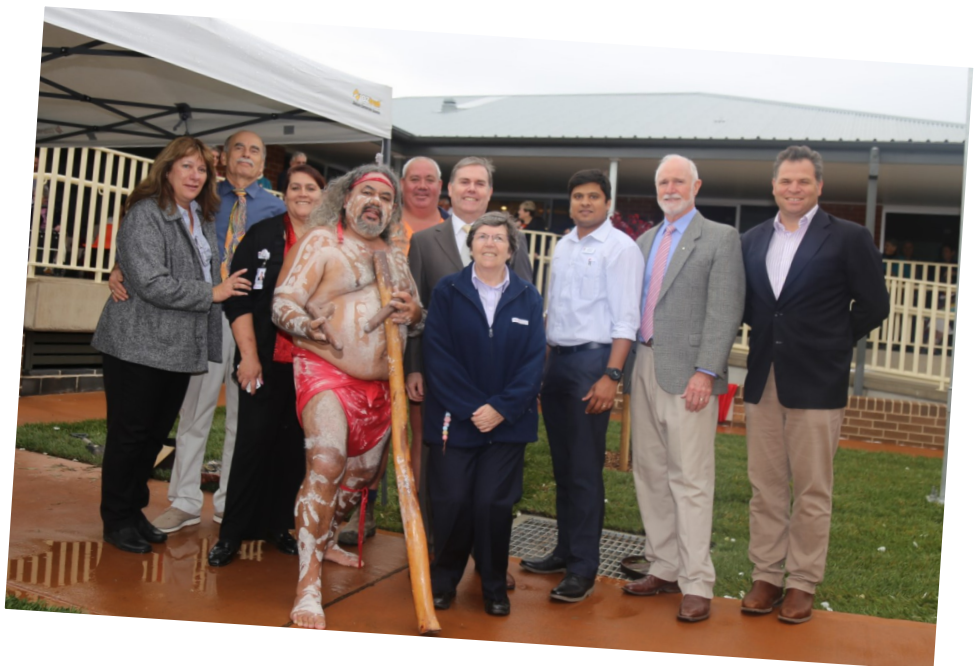
Photo: The Molong MPS team with Western NSW Local Health District executive and other special guests during the “welcoming” event.

The Molong MPS redevelopment project is part of a greater $300 million program of works to upgrade existing or build new MPS facilities in a number of rural and remote communities across NSW.