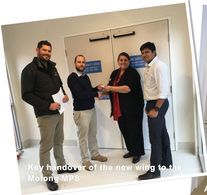
Key handover of the new wing to the Molong MPS