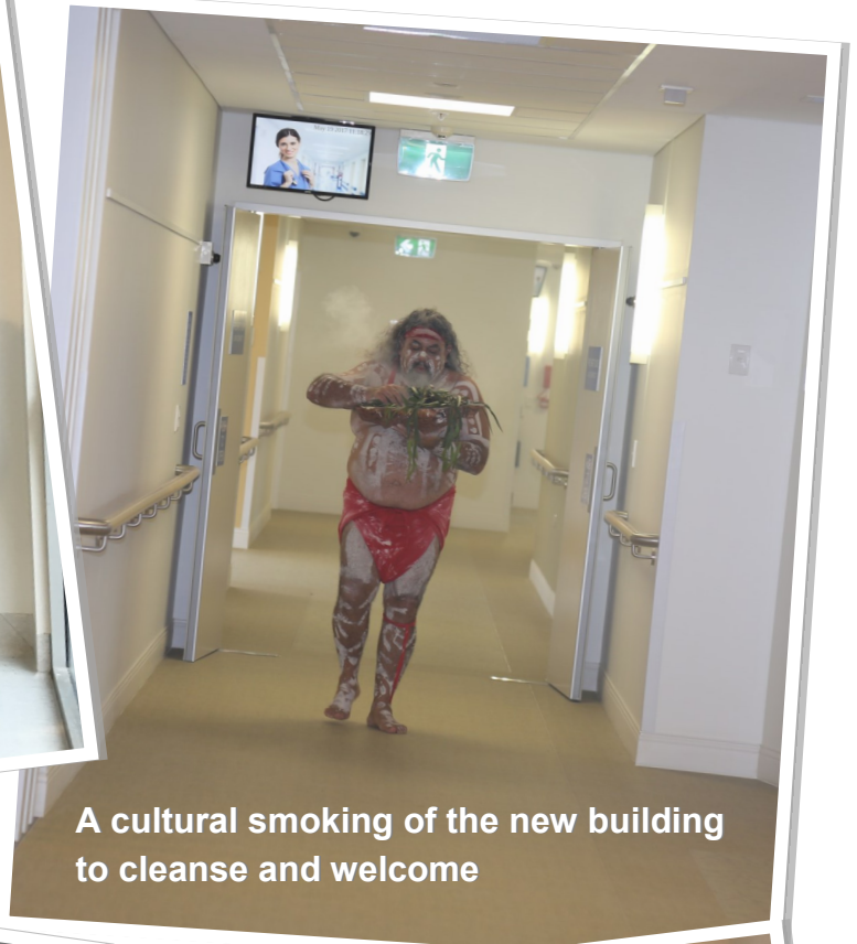
A cultural smoking of the new building to cleanse and welcome