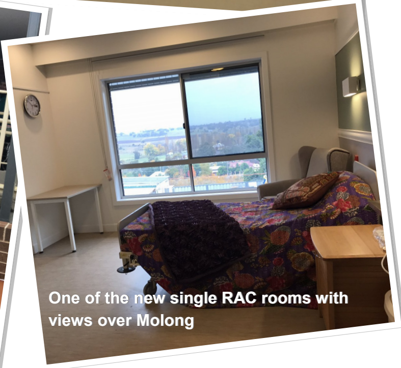
One of the new single RAC rooms with views over Molong