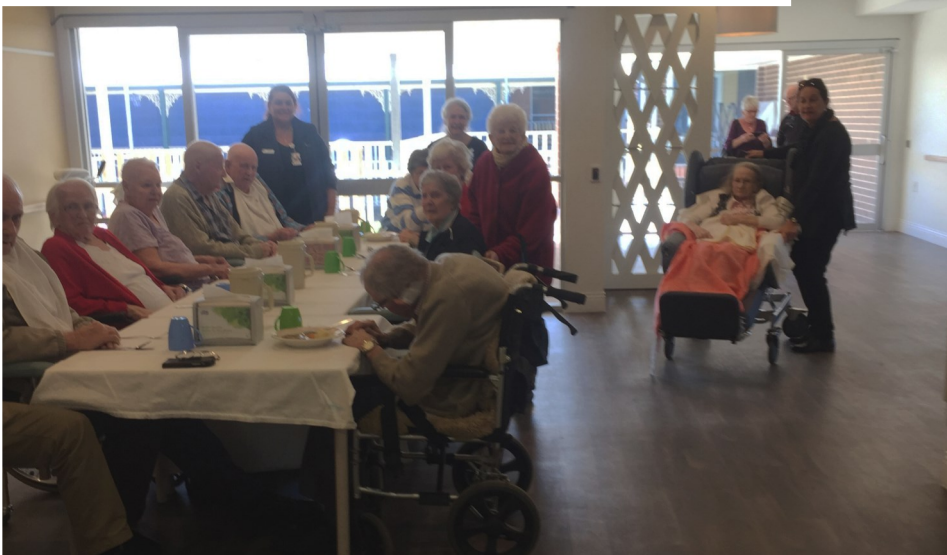
Photos, clockwise from left: The first meal in the new dining room; recent "cuppa catch-up" on the redevelopment; big smiles on moving day; and some of the wonderful nursing staff at the Molong MPS.