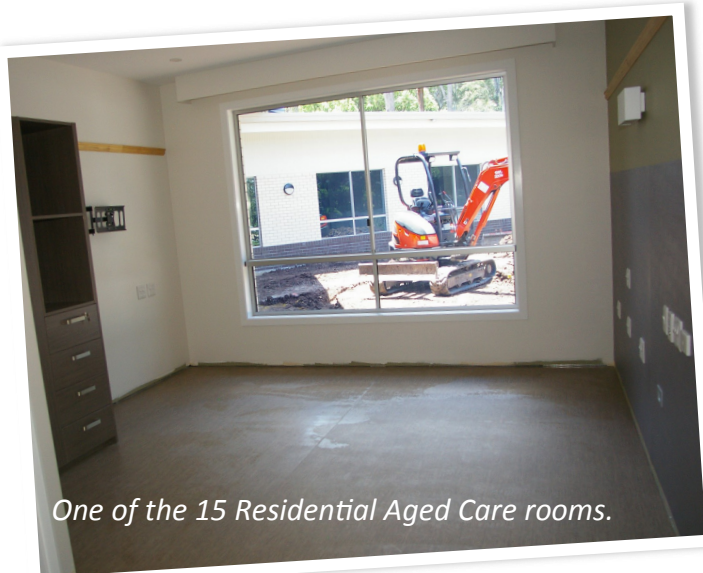
One of the 15 Residential Aged Care rooms.