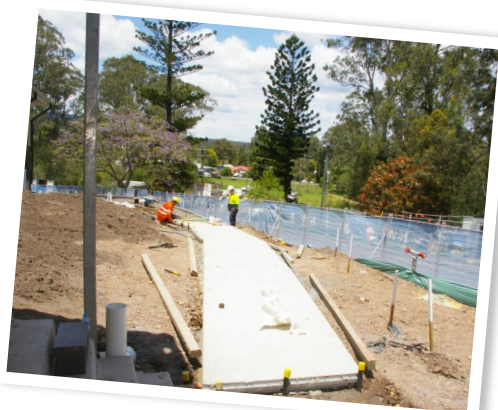
Front footpath being laid

Landscaping has commenced as the finishing touches are being put into place inside the new state-of-the-art facility.