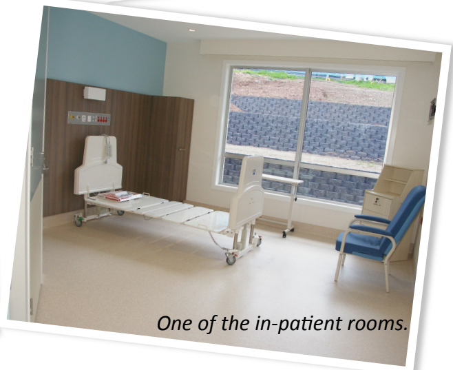
One of the in-patient rooms.

The Project Team seek your patience during the construction of the Bonalbo MPS and wish to advise that strategies are in place to keep disruption to a minimum.