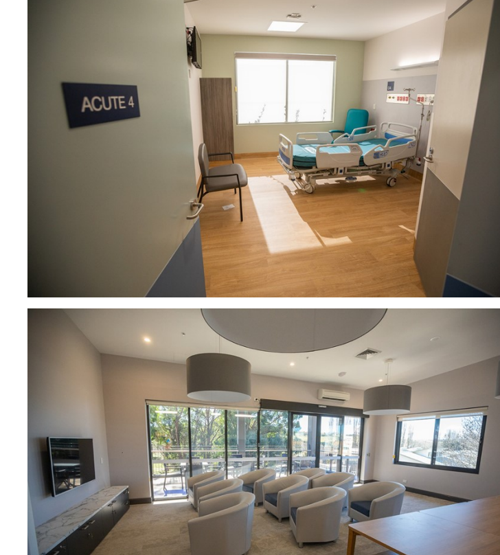
Pictured above: Inside the Braidwood MPS.

Finishing works include demolishing the old hospital buildings and building the new staff accommodation units, car parking areas and landscaping outdoor areas.