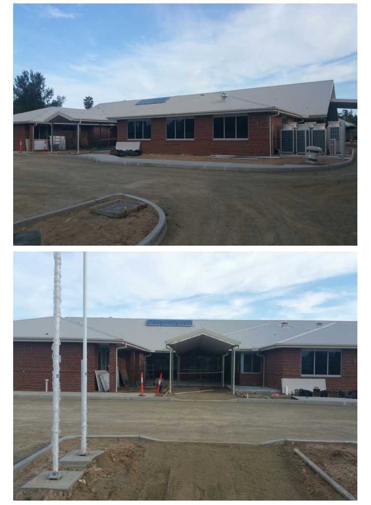
Above: Front and side views of the Culcairn MPS