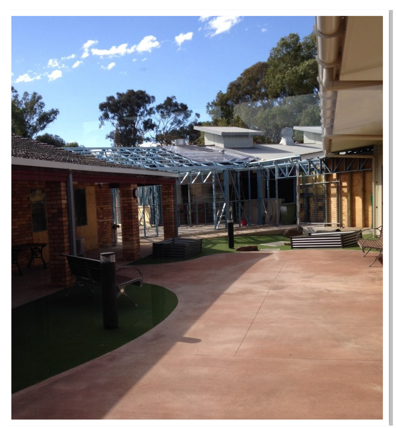
Photo above: The new "Magnolia House" Residential Aged Care wing is nearing completion, as seen from the internal courtyard (not yet complete) attached to "Rosella Place".

After much progress, the redevelopment is entering the final stages, with construction scheduled to be complete later in 2018.