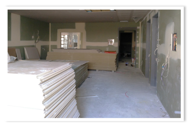
Internal wall sheeting is completed in the emergency department.