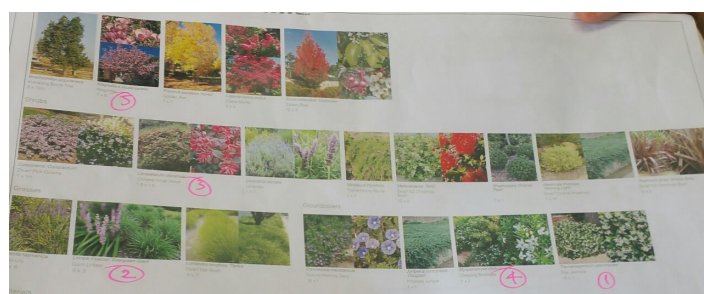
Above: Some of the trees and shrubs being considered for planting.

The space will be a place of beauty and contemplation for residents and their families as well as visitors.