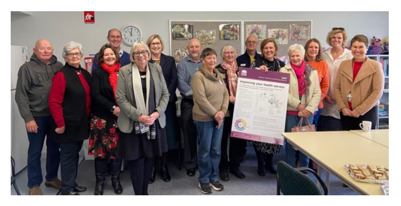
Above: Representatives from Hay Hospital Auxiliary, Hay Local Health Advisory Committee and Hay Shire Council had an opportunity to tour the redevelopment works and meet with the MLHD Chief Executive and Board Chair in June.