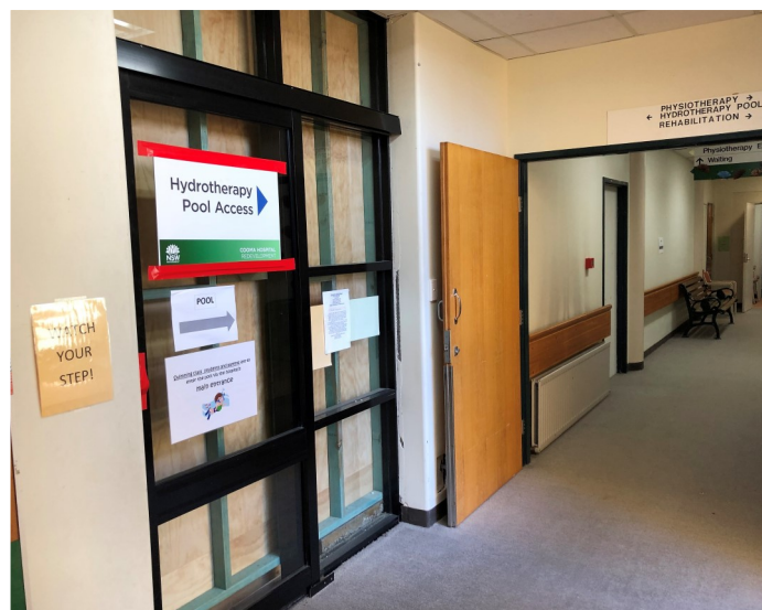
Signs marking the Hydrotherapy Pool entrance.

The centres will make inroads into the issue of accessibility to healthcare in regional areas, as well as offer potential for collaboration, bridge building and professional development between health service staff and the universities.