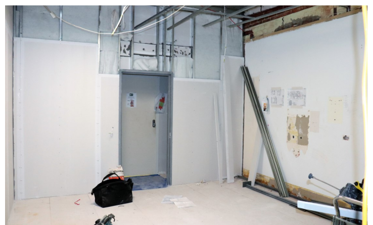
The new medical records room.