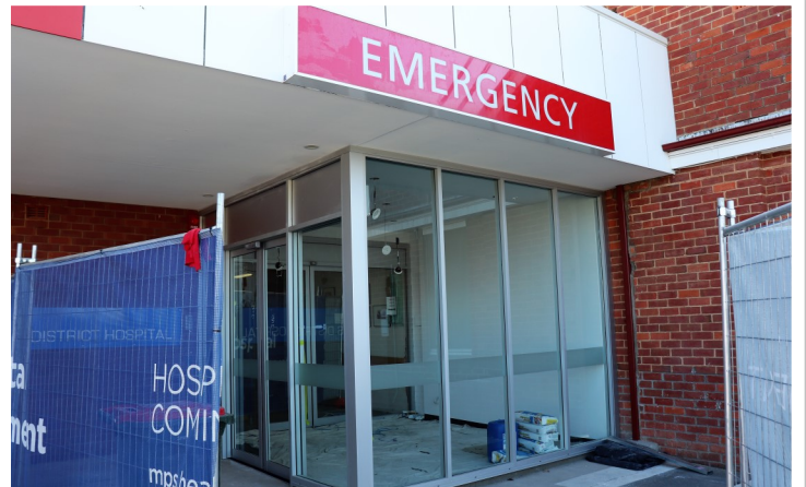
The new entrance airlock is almost complete.

If you would like to join our small working group please email your interest to SNSWLHD-Redevelopments@health.nsw.gov.au .