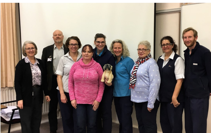
The final Rehabilitation and GEM Project User Group.

Watch this space for the opportunity to be one of the first to see and experience all that will be coming to Goulburn in 2021!