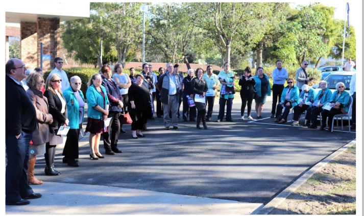
Attendees gather around to hear the launch announcement.

The nurse practitioner led model of the ATC is performing well, with the practitioner able to triage category 4 and 5 patients, write prescriptions, stabilise presenting patients if required and create a pathway of care as needed.