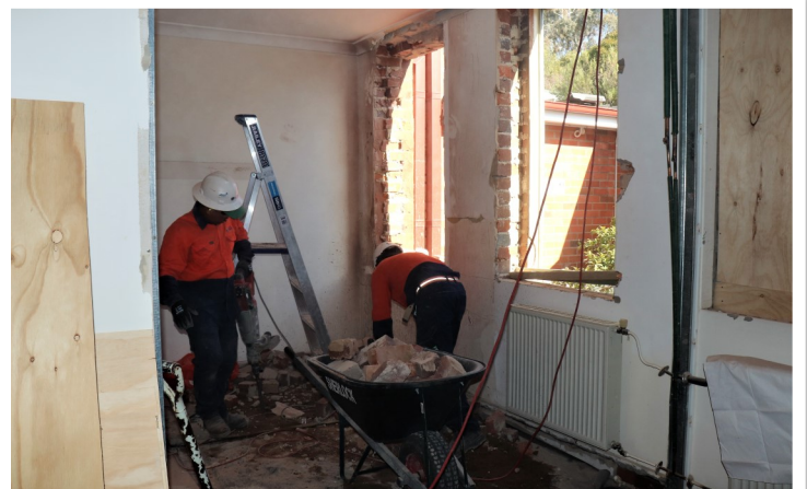
Workers forge ahead on the palliative care inpatient rooms.