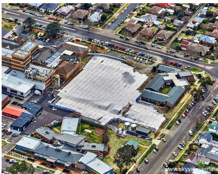
Aerial view of site of the new clinical services building.

The main goal is to ensure that all staff and patients are able to successfully transition into the new building and are able to immediately provide and receive safe and efficient care in the new hospital environment.