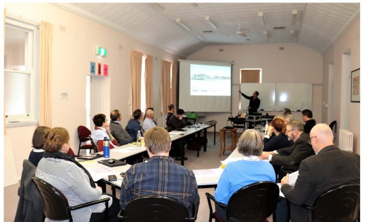
The project team presented with the new proposed façade.

The project team would like to thank each of the PUG representatives for their time, hard work and dedication to the project. The help and expertise of the PUGs has been invaluable.