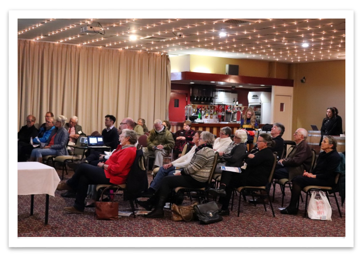
The Cooma Community Consultation attendees.