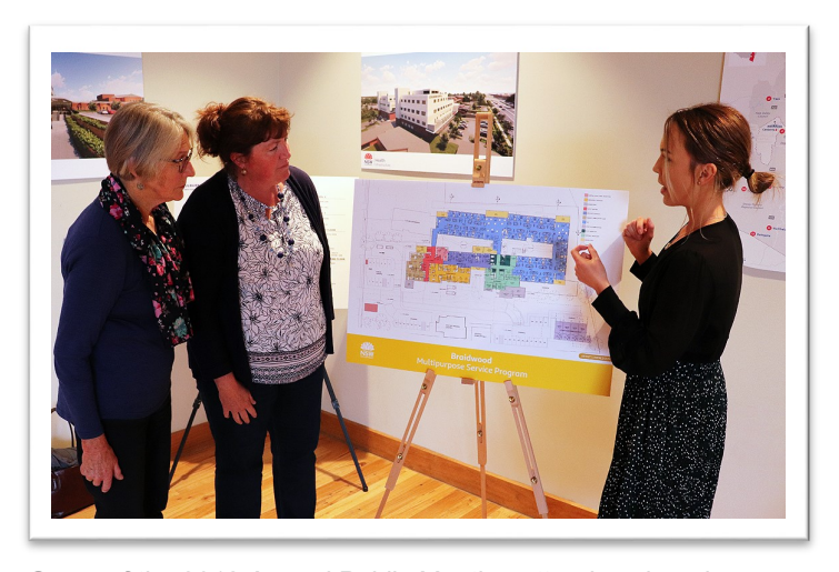
Some of the 2018 Annual Public Meeting attendees learning about the Braidwood MPS Redevelopment.

www.mps.health.nsw.gov.au/Projects/ Braidwood