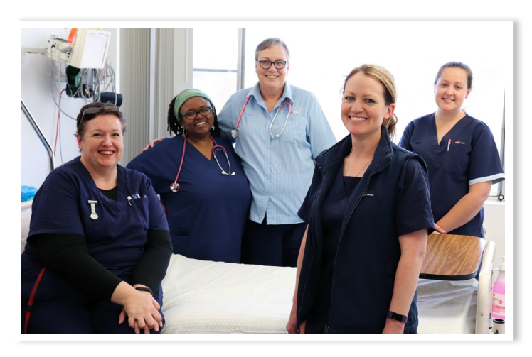
Some of our fabulous staff at Yass Hospital.

Stage 2 will be complete in the coming weeks, with the addition of an accessible toilet, parents' room, and a kids' corner adjacent to the new waiting area.