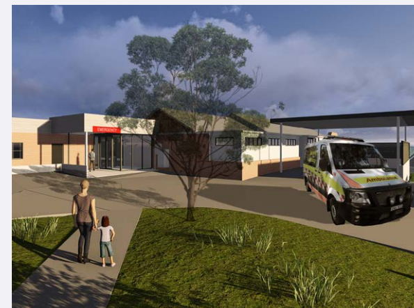
View of the Hospital main entrance from 145 Meehan St, Yass NSW 2582