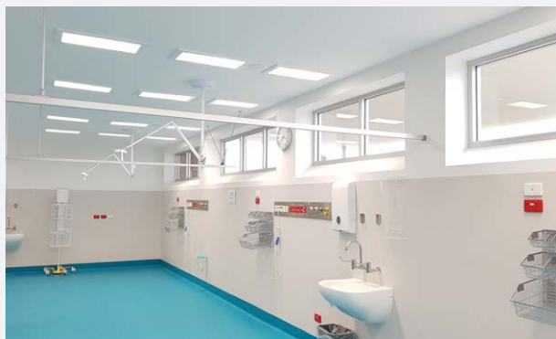
New emergency bay

It is anticipated these final portions of work will be completed by October 2020.