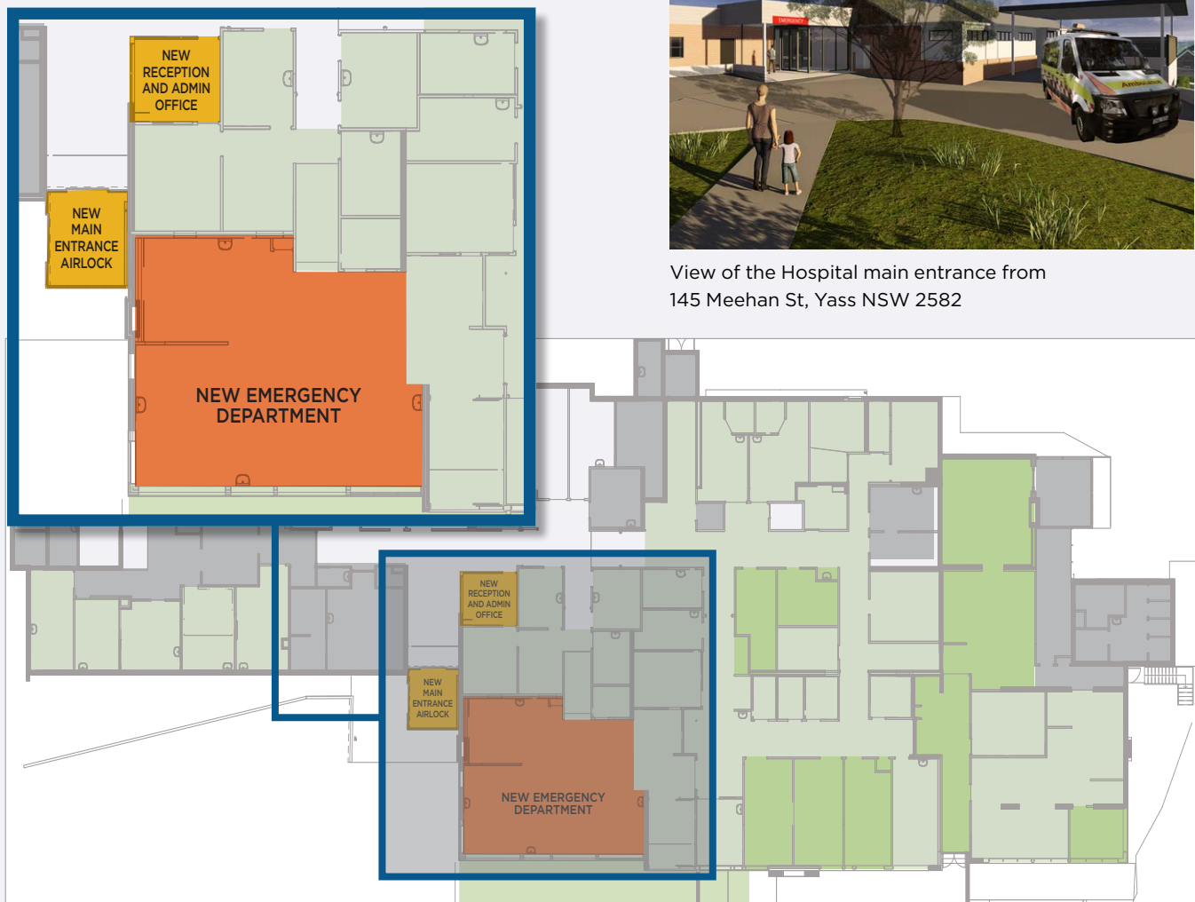
Yass Hospital Redevelopment site plan

Here is the latest floor plan to help you find your way around.