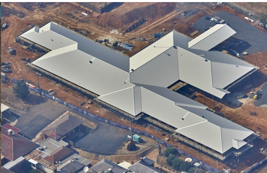
View of the new Hospital building from the air, late January