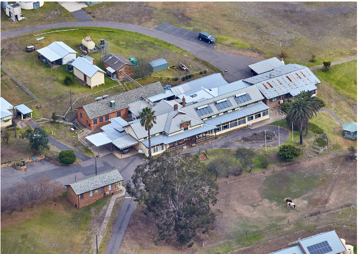
Aerial view of current Murrurundi Hospital site.

www.mps.health.nsw.gov.au/Projects/Murrurundi