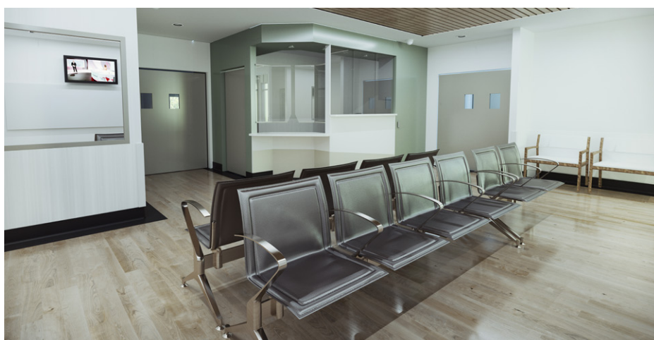
Artist's impression of waiting reception.

care services will continue to be provided separately by the local residential aged care facility.