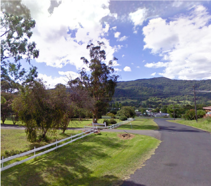
Views from the Murrurundi Hospital site.