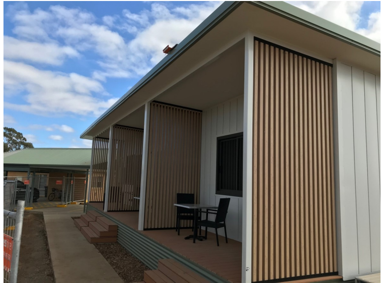
Above: Construction of the new staff accommodation units is nearing completion

Thank you to the residents, patients, community and staff for your understanding as these works continue. The final stage of works in the Hospital is underway to reconfigure the Reception, Office and Interview Room. Visitors will notice the temporary relocation of the Reception, and hoarding is in place to provide a safety barrier for the works in progress.