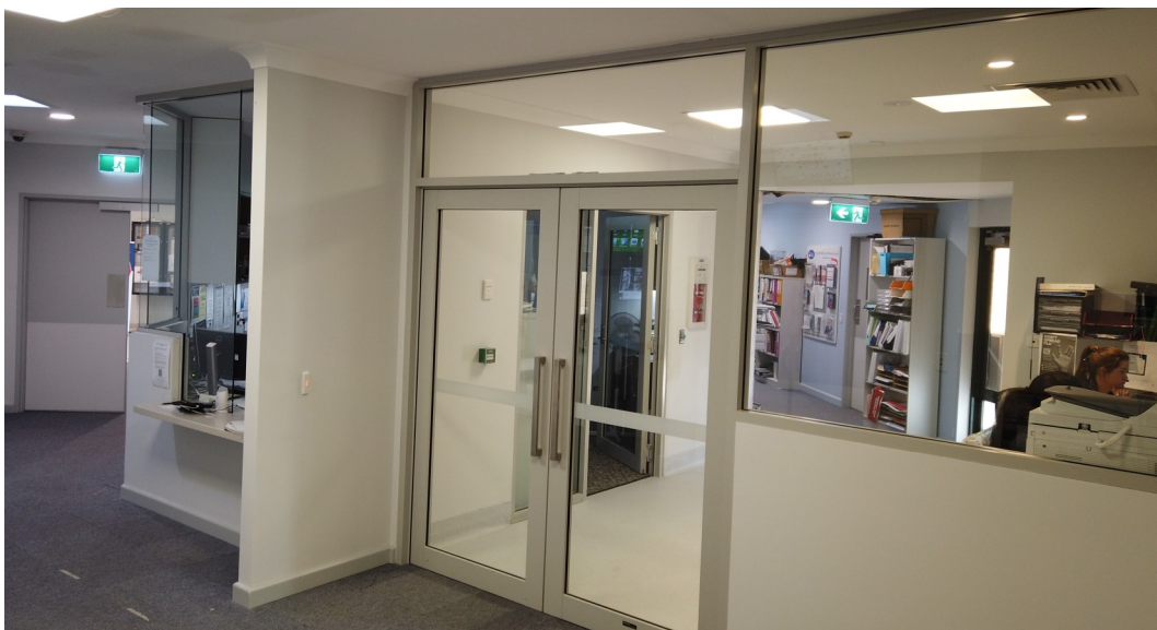
Left: the refurbishment of the administration area and staff station is finished, the administration area is the temporary reception while works are being completed.

Staff are now working in the new triage room, staff station and administration areas. The refurbishment works to these important areas included reconfiguration of the spaces, new walls, carpets, internal glazing and fitout. The two new hydrant and sprinkler tanks have been installed as part of the fire protection system.