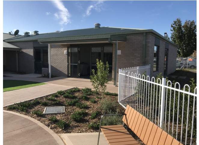
Above and left: the new courtyard garden constructed between the existing wing and the new Residential Aged Care wing. Planter boxes seen at the back of the garden are available for resident gardening activities.