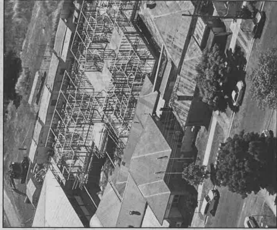
An aerial view of the frames and the new structure being built.

Residents and staff are excited to see the physical changes occurring and were updated on the progress at a site update meeting in October. Construction is expected to be complete late in 2017.