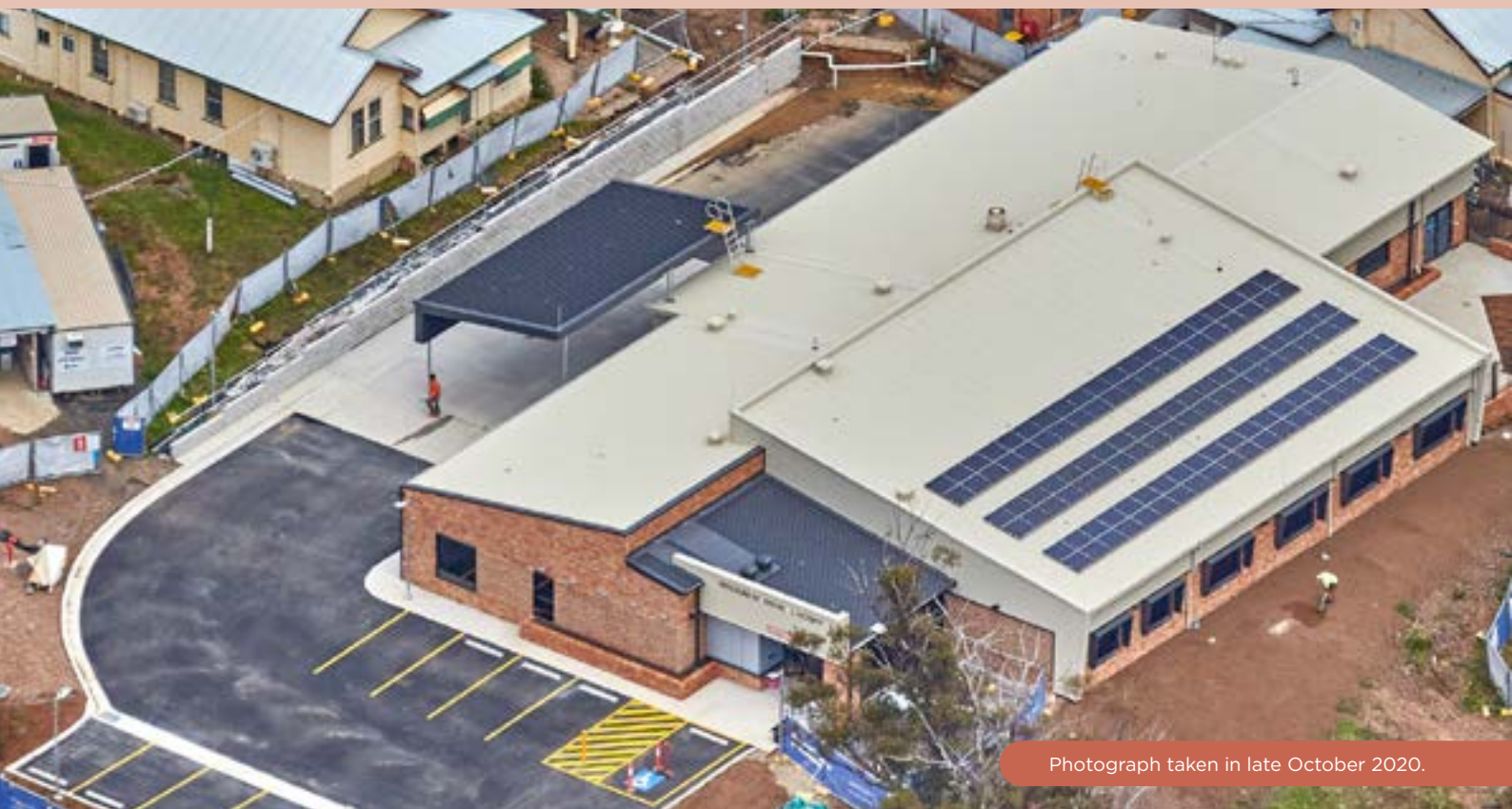
Photograph taken in late October 2020.