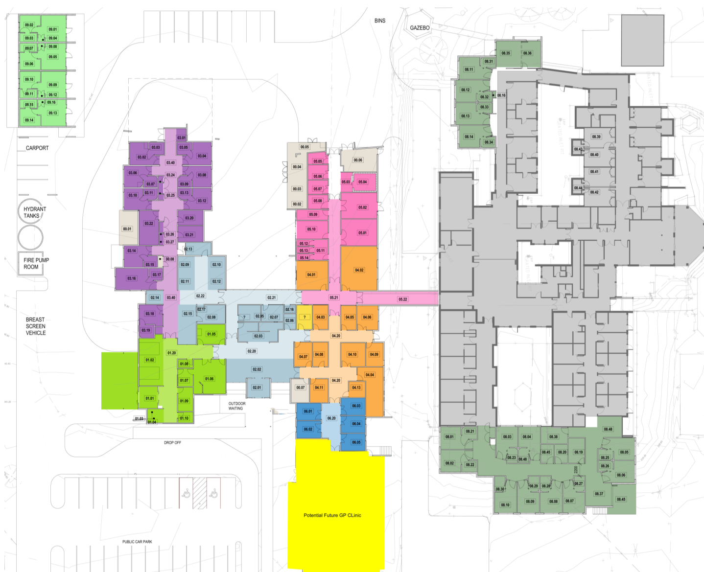
Above: Updated plans for the new Cobar Health Service following the detailed design stage, showing the Health Service on the left joined to the existing RAC building (with additions) on the right.

The updated plans for the new Cobar Health Service following the detailed design stage are included below.