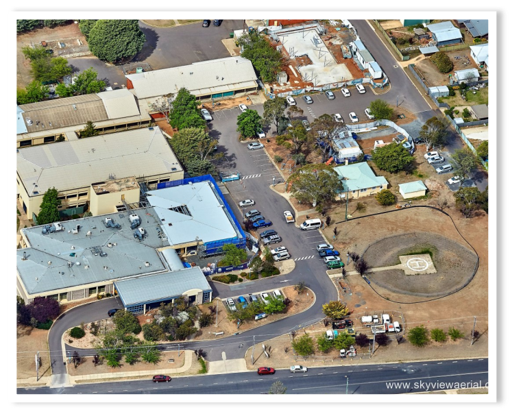
The aerial view of the Cooma Hospital site.