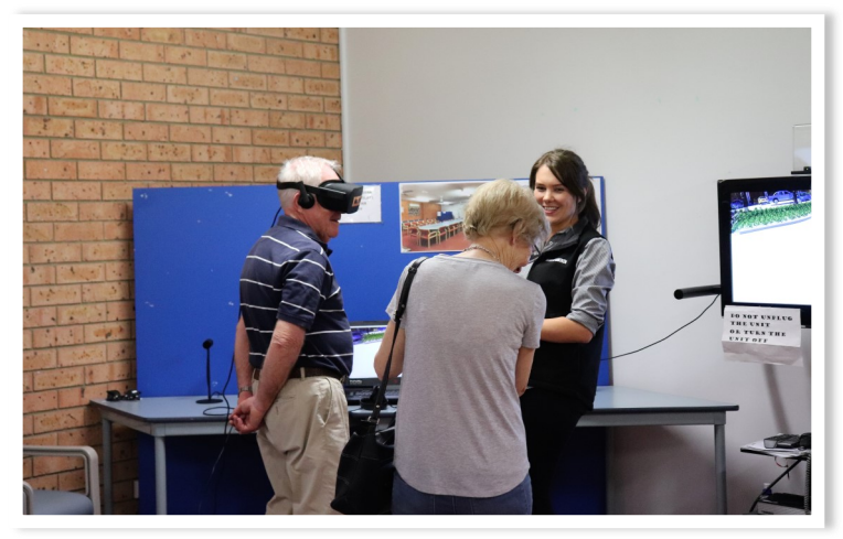
Members of the Goulburn community test out the VR display.