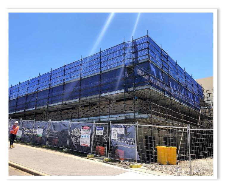
The footprint of the new maternity building is taking shape.

If you would like to join our small working group please email your interest to SNSWLHD-Redevelopments@health.nsw.gov.au.