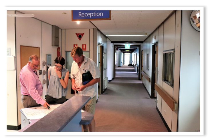
Pambula staff station before demolition.

The next stage is well underway, with demolition of the staff station, medication room and hallway in its final stages, and due for completion in May 2019.