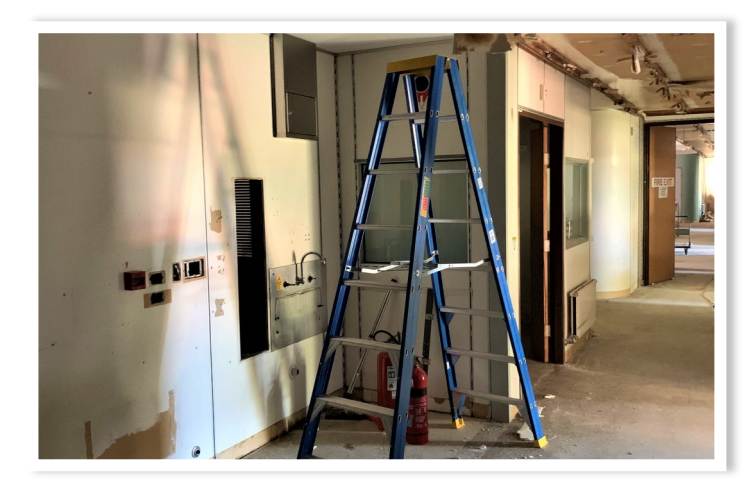
Pambula staff station after demolition.