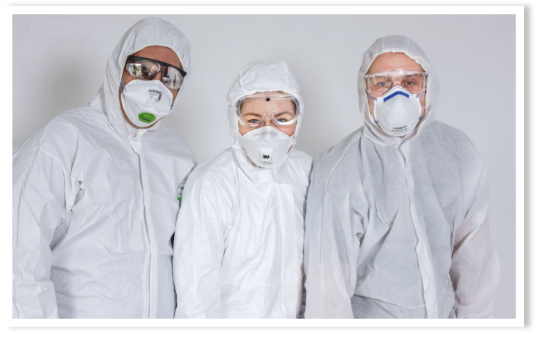
Example of full-body PPE worn by Goulburn construction workers.

Contact the Capital Works Team on 02 6150 7339 or email SNSWLHD-Redevelopments@health.nsw.gov.au