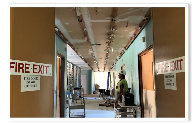
Pambula hallway demolition.