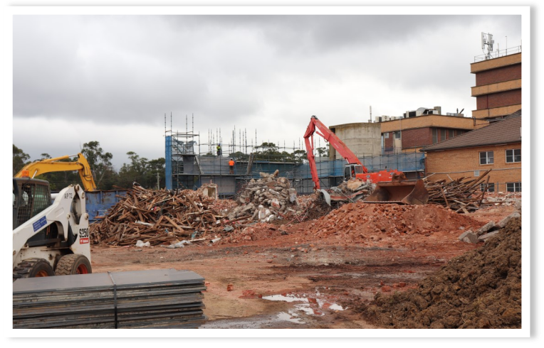
Clearing the way for the new four storey clinical services building.