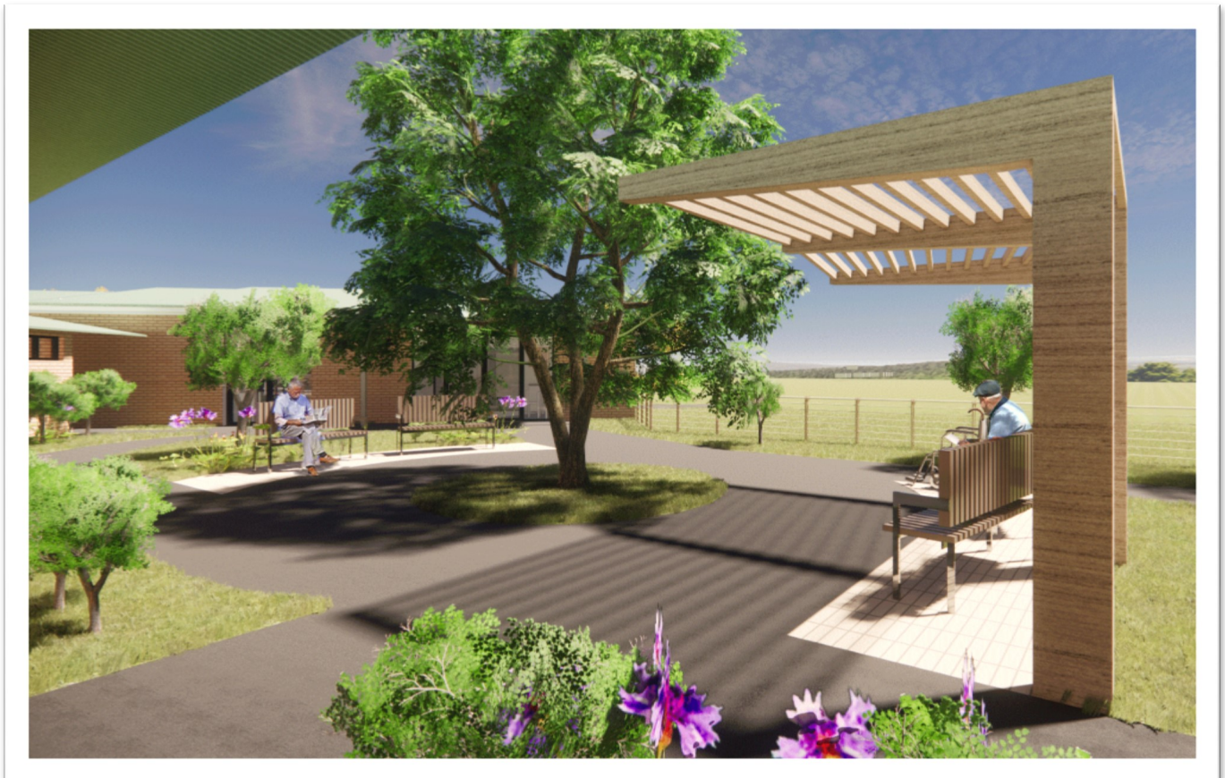
Above: An artists impression of the new resident courtyard planned for the redeveloped Health Service

The expansion of the Health Service will provide improved facilities to support the delivery of flexible and integrated healthcare to the community. The project includes the extension of Residential Aged Care, new staff accommodation and upgrades to existing emergency facilities – providing capacity to meet the health needs of the Hay community now and into the future. The project is scheduled for completion in 2021.