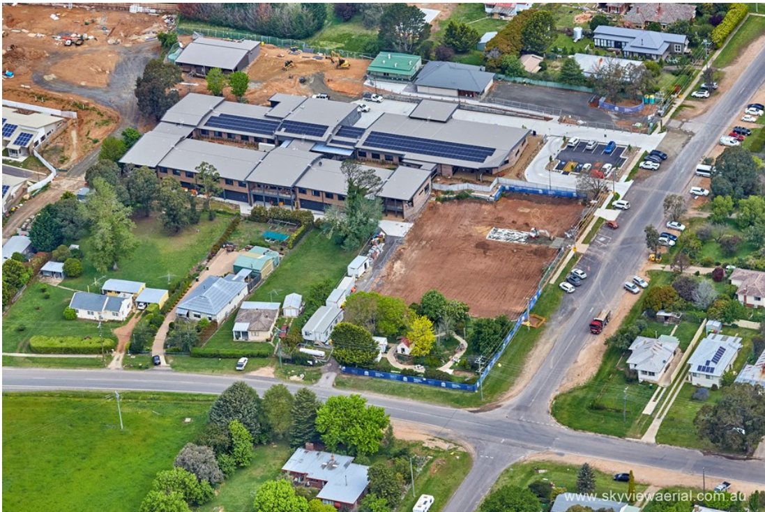
October 2020: Demolition works are complete and landscaping works get underway.