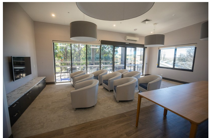
Pictured above: Inside the Braidwood MPS.