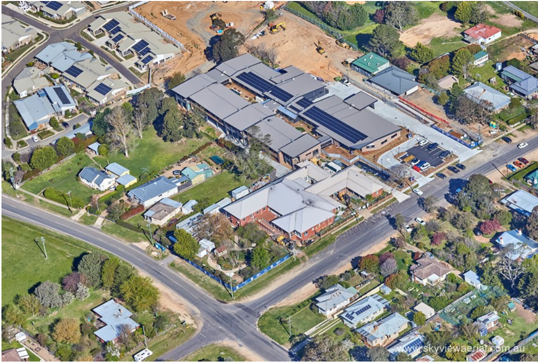
September 2020: Finishing works commence.