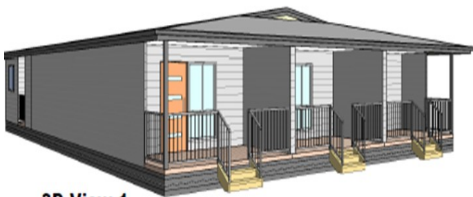
3D View 1