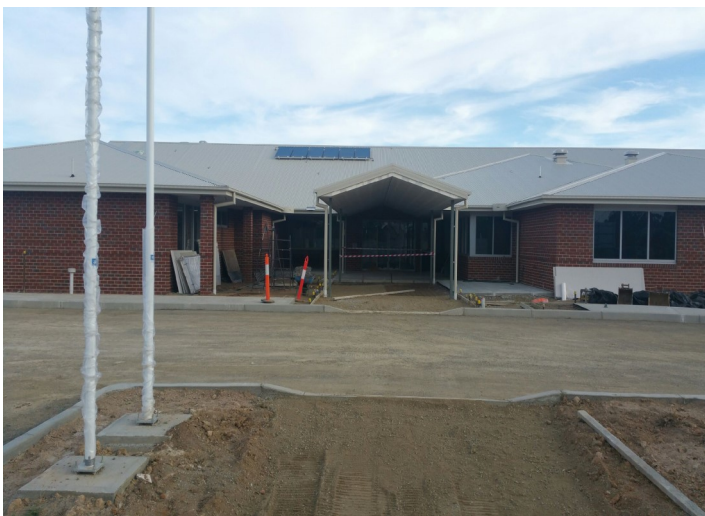
Above: Front and side views of the Culcairn MPS