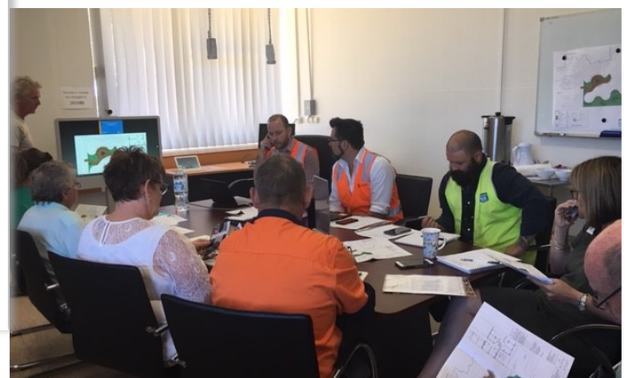
Working group meeting, Feb 2019