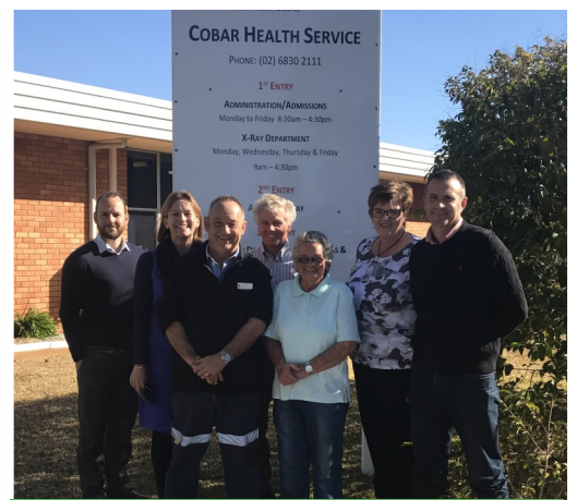
First working group meeting, Aug 2018