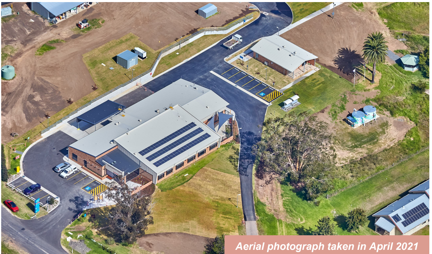
Aerial photograph taken in April 2021