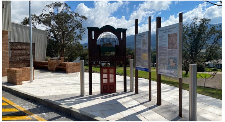
Sneak peak of the heritage installation (above) and the new staff accommodation building (below)