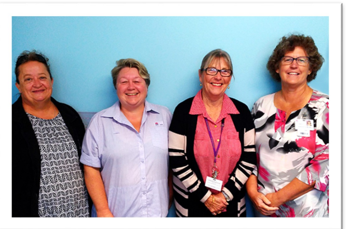
Some of our valued Project User Group representatives.