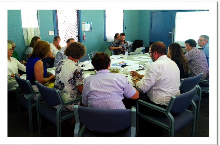
A Project User Group carefully reviewing detailed designs.