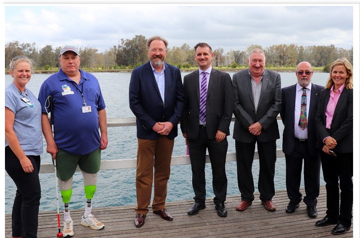
SNSWLHD, Health Infrastructure and valued community representatives at the Eurobodalla Health Service announcement.