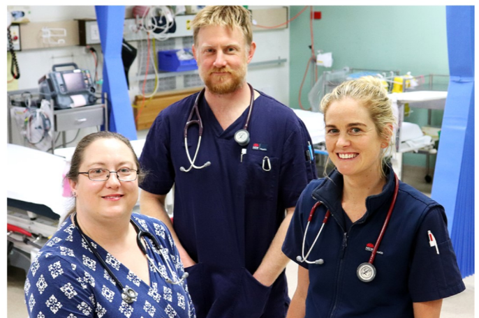
Some of our wonderful staff at Cooma emergency department.