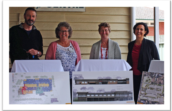
Braidwood MPS staff showing off the designs of the new facility at the Hospital Open Day.