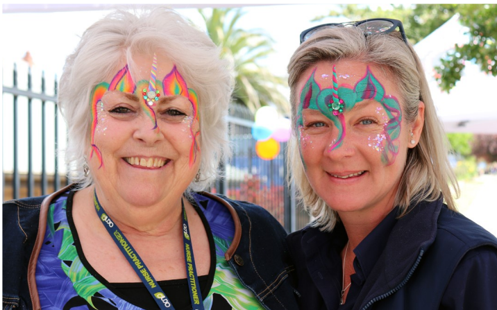
Our wonderful staff getting into the spirit at the Goulburn Hospital Open Day.