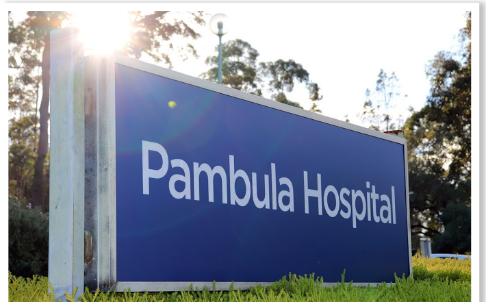
New entrance to Pambula District Hospital.