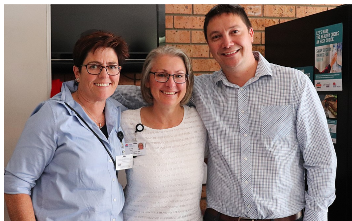
The GH&HS Redevelopment team at the Goulburn Hospital Open Day.