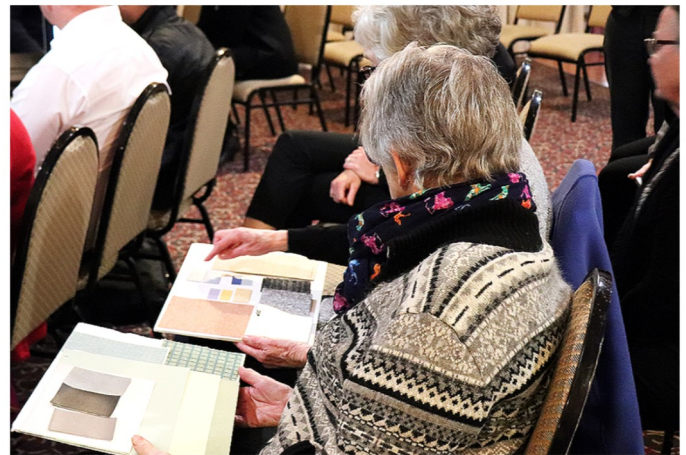
Cooma residents carefully reviewing the proposed interior design scheme.