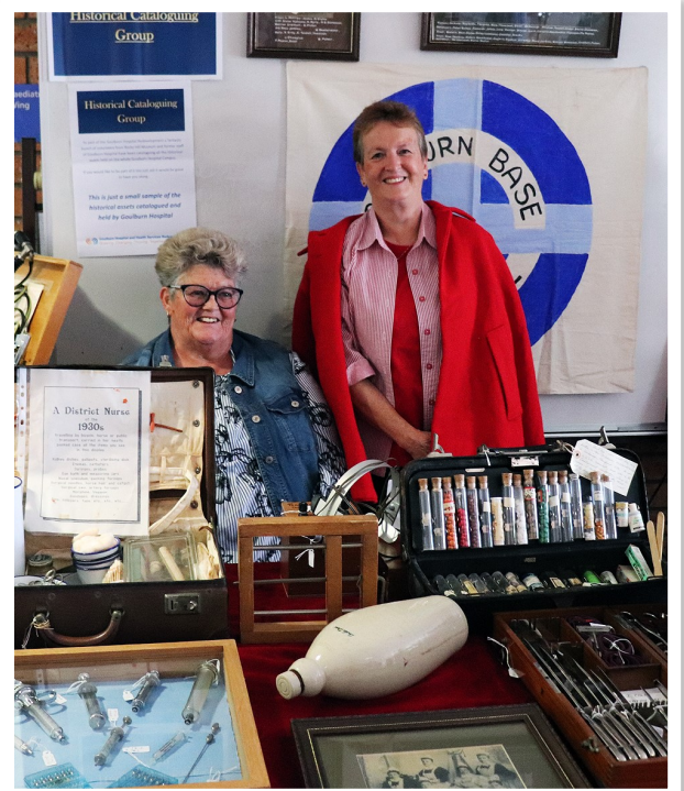
Members of the Historical Society at the Goulburn Hospital Open Day.