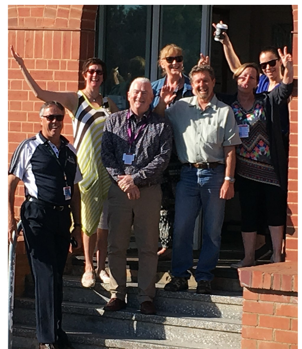
The CMHDA team moments before moving into their new digs.