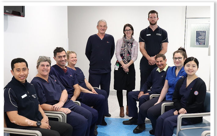
Some of our terrific staff at Pambula District Hospital.