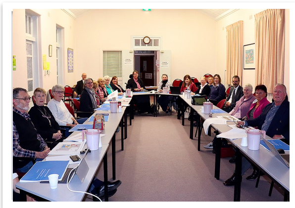
Patient and Consumer PUG held 24 July 2018.

The Redevelopment Project Team would like to thank each of the PUG representatives for their time, hard work and dedication to the project. As the project is a major upgrade, the planning and consultation undertaken for Goulburn has been extensive. The assistance and expertise of the PUGs is invaluable and will help to ensure fit-for-purpose health care for Goulburn and its surrounding communities well into the future.