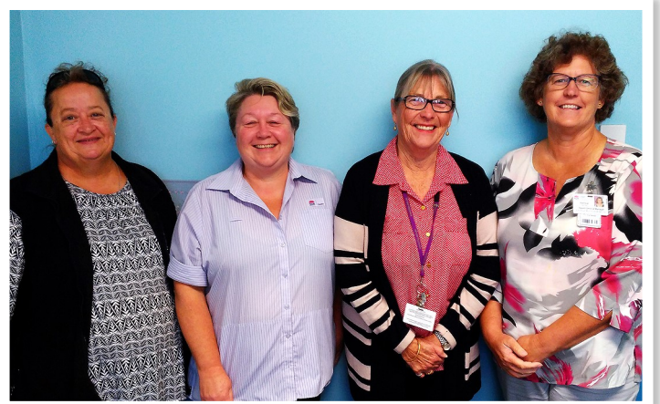
Various Detailed Design PUG representatives—hospital staff.

The Redevelopment Project Team would like to thank each of the PUG representatives for their time, hard work and dedication to the project.