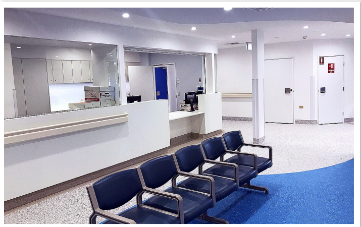
The refurbished Pambula District Hospital entrance.

Ambulance staff are instructed to continue using the current entry point.