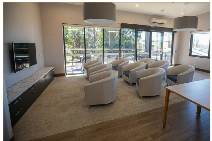
37 residential aged care beds with activity rooms, lounge and dining facilities