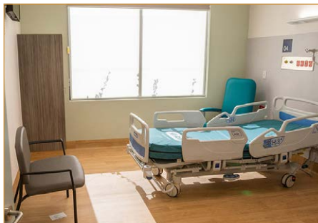
In-patient rooms designed according to latest models of care, including acute care beds