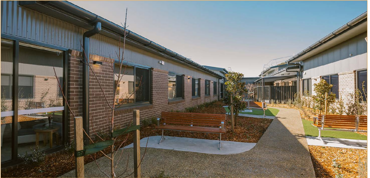
Outdoor visiting spaces and courtyards. Refer to the Master Plan for more insight into landscaping around the Braidwood MPS.