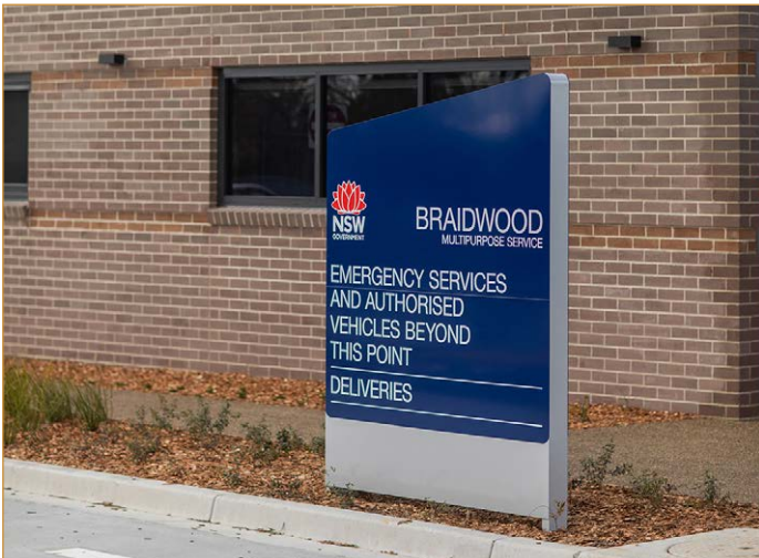
Emergency Department with dedicated ambulance entry