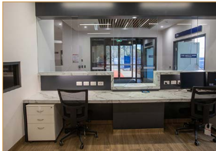
View from reception