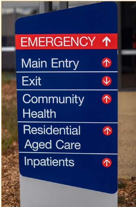
Health Services co-located under one roof