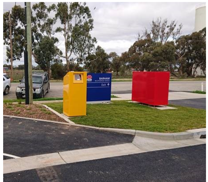
Below: The community sharps bin.