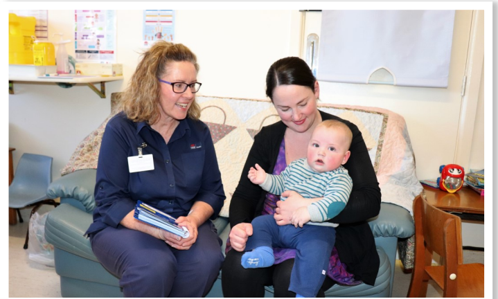
Our valued staff and patients at Crookwell.