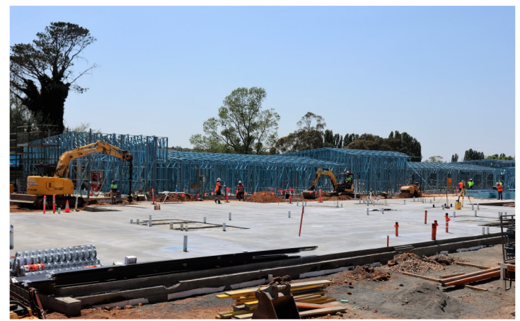
Framing on the Braidwood MPS forges ahead.