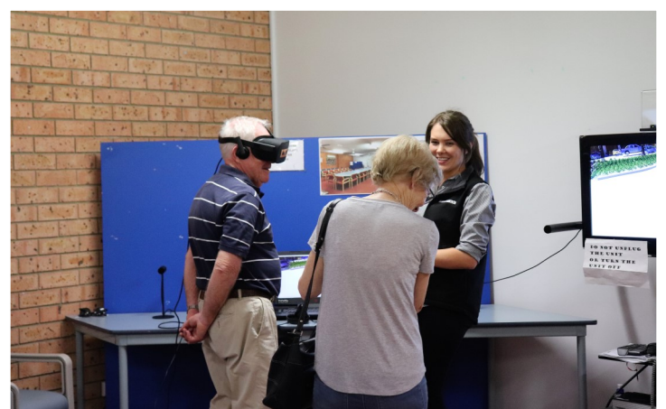
Members of the Goulburn community test out the VR display.