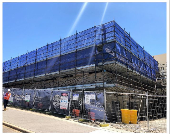
The footprint of the new maternity building is taking shape.

If you would like to join our small working group please email your interest to SNSWLHD-Redevelopments@health.nsw.gov.au .