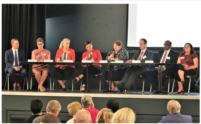
The 2019 Annual Public Meeting panel.

The Clinical Services Plan (CSP) has been drafted by SNSWLHD and is currently under review by the Ministry of Health. The CSP will help to determine the requirements for a new hospital site in Eurobodalla, and confirm the role of the hospital