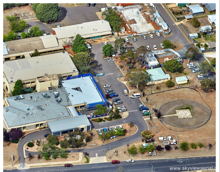
The aerial view of the Cooma Hospital site.