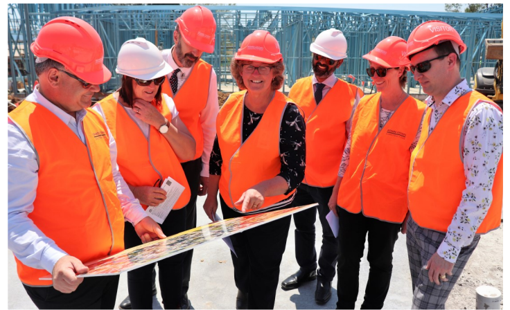
NSW Deputy Premier inspects the plan with the LHD project team.

When complete, the project will deliver new in-patient rooms, increased residential aged care beds with activity rooms, lounge and dining facilities, a new emergency department with dedicated ambulance entry, and new staff accommodation in a purpose-built facility.