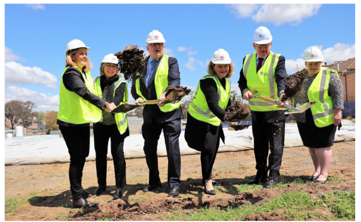
The first sod is turned for main works on the Goulburn project.

The main works are expected to be complete in 2021, with operational commissioning in 2022.