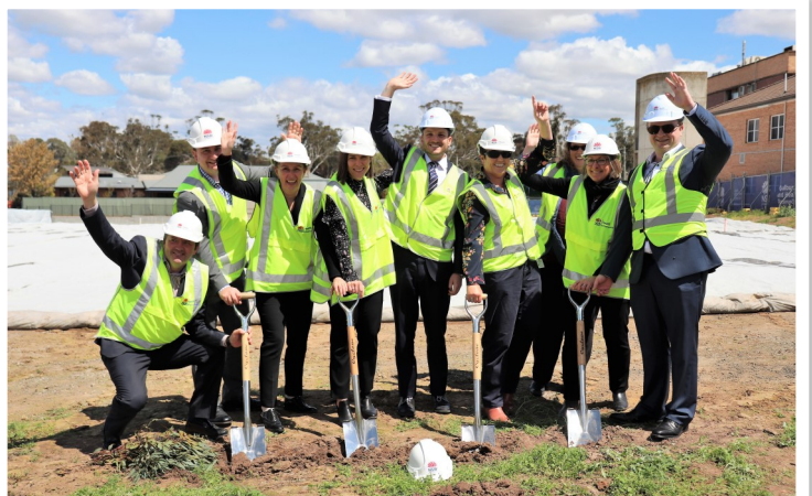
The project team celebrates the significant milestone.