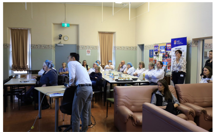
Goulburn staff and medical officers are presented with a project update.

The carpark includes one five-minute drop-off zone and three 15-minute drop-off zones for the emergency department. There are also spaces reserved for accessible drivers and medical staff with spaces colour coded and sign posted.