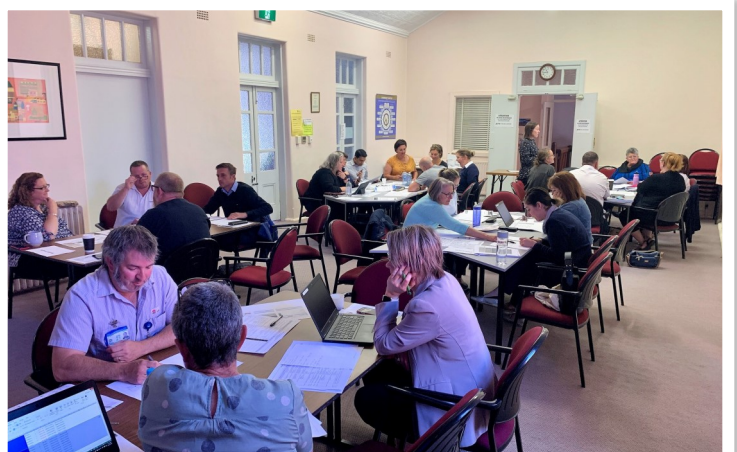
Change workshop participants work through ways of improving processes.