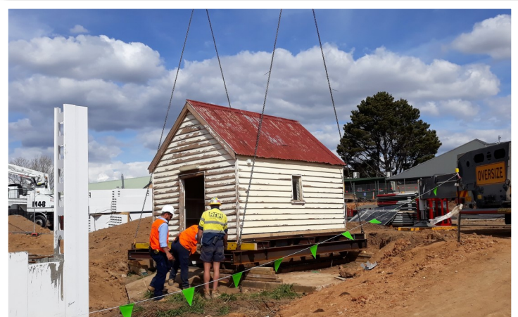
The 1904 historical morgue is successfully relocated.