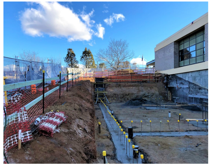
The concrete footings for the new maternity building.

If you would like to join our small working group please email your interest to SNSWLHD-Redevelopments@health.nsw.gov.au .