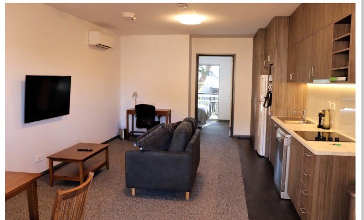
Inside one of the units, featuring a balcony off the bedroom.