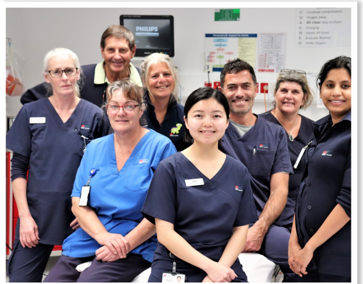
The Pambula team soaking up their new workspace.

The hospital also boasts a resurfaced carpark and new driveway, with limited works being scoped for the Community Health building.