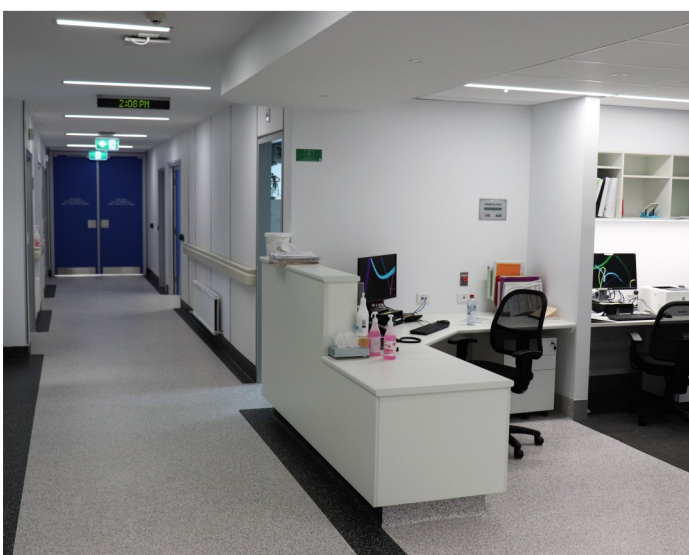
The completed staff station.