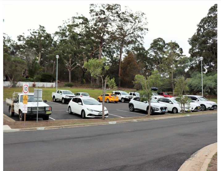
The newly resurfaced hospital carpark.