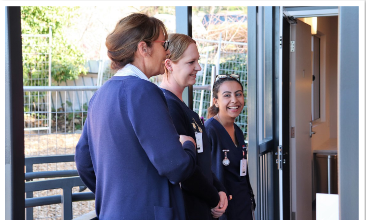
Hospital staff enjoy their first walk-through at the internal unveiling.