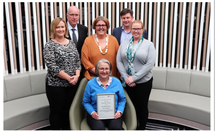
The KHWA team all smiles after collecting their award.