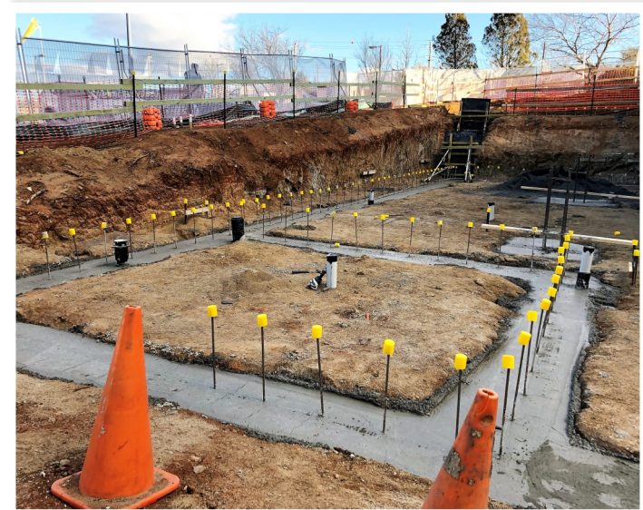
The concrete footings for the new maternity building.