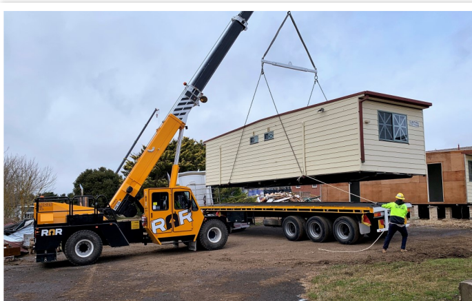
RAR contractors load the first demountable onto the truck.