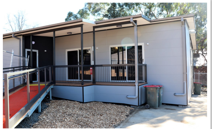
The external façade of the new staff accommodation at Yass Hospital.