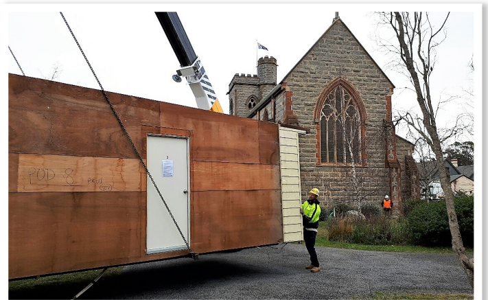
The demountable buildings are relocated to their new home.

“With each project we also aim to help local charities or community groups, so we were very thankful for the opportunity to provide Gumtree Cottage as a donation and to help relocate it to the Braidwood Anglican Church grounds.