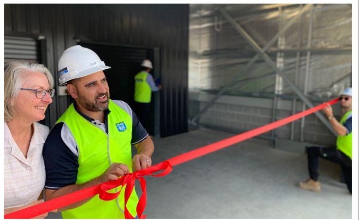
The official handover of the new Waste Shed to the LHD.

The project team deserves a special mention for all the major pieces they've accomplished over the last month, it's been an extraordinary amount of work.