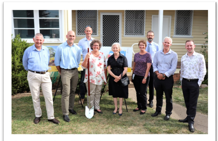
Members of the Braidwood MPS Redevelopment project team, the Community Consultative Committee and Richard Crookes Constructions help turn the first sod for the project.