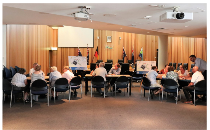
Some of the attendees of the first community consultation session.

Recommendations will now go to GMC to respond to some of the feedback received. A final proposal will be reviewed and approved by GMC in the coming months.