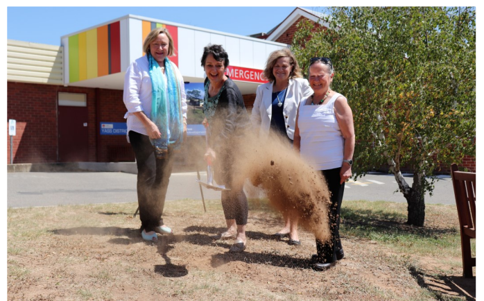
Members of the Yass Hospital Redevelopment project team, the Community Consultative Committee and Richard Crookes Constructions help turn the first sod for the project.