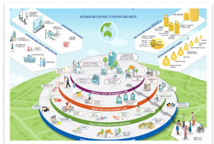
Australia's Health Landscape 2017-2018

Light refreshments will also be provided.