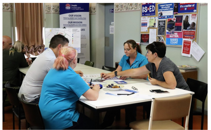
Attendees workshoping ideas at the staff consultation session.