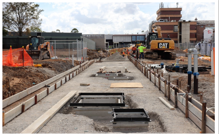
Work on the main service trench continues.