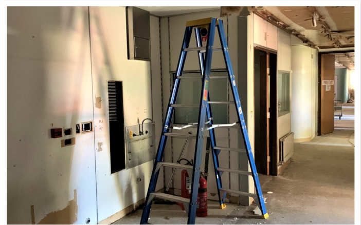
Pambula staff station after demolition.