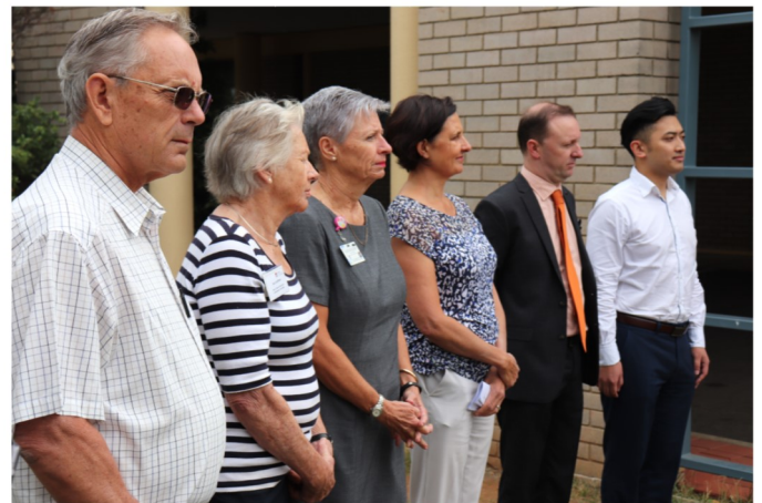
Members of the Cooma Community Consultative Committee, SNSWLHD and Health Infrastructure watch on as the successful contractor is announced on 1 February 2019.

If you have any questions or concerns please contact the redevelopment team on SNSWLHD-Redevelopments@health.nsw.gov.au .