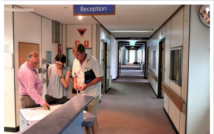
Pambula staff station before demolition.

The next stage is well underway, with demolition of the staff station, medication room and hallway in its final stages, and due for completion in May 2019.