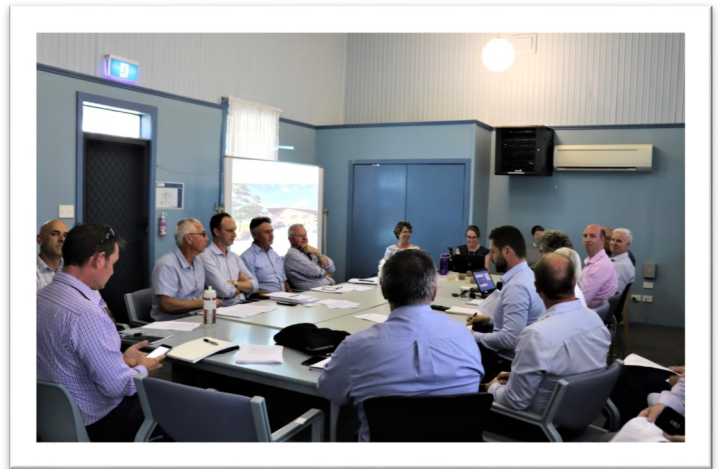
Members of the redevelopment project team and Richard Crookes Constructions discuss planning details.