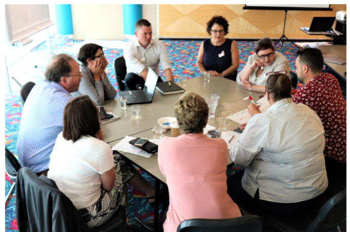
Some of the Eurobodalla Surgical Model of Care Workshop participants.