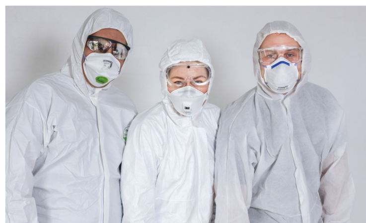
Example of full-body PPE worn by Goulburn construction workers.