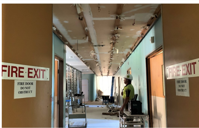
Pambula hallway demolition.