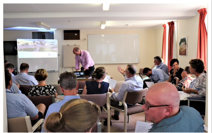
Members of the redevelopment project team and Richard Crookes Constructions in talks about construction planning.