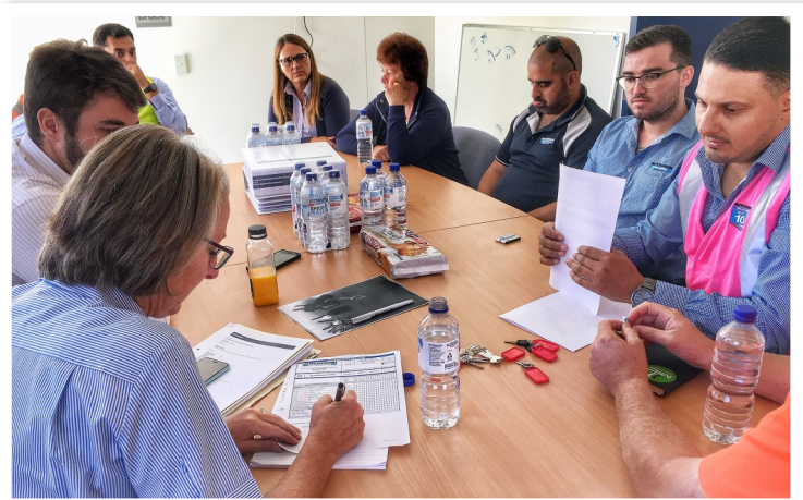
The official handover of the Asset Management Office to the LHD.

The project team is making sure every precaution is taken, with the safety of local residents, the general public, hospital users and construction workers being our highest priority.