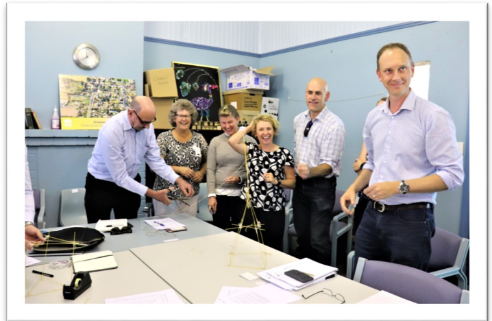
Team building fun with members of the redevelopment project team and Richard Crookes Constructions during the start-up workshop.

The project team and contractor have already commenced preliminary planning with construction expected to begin next month.