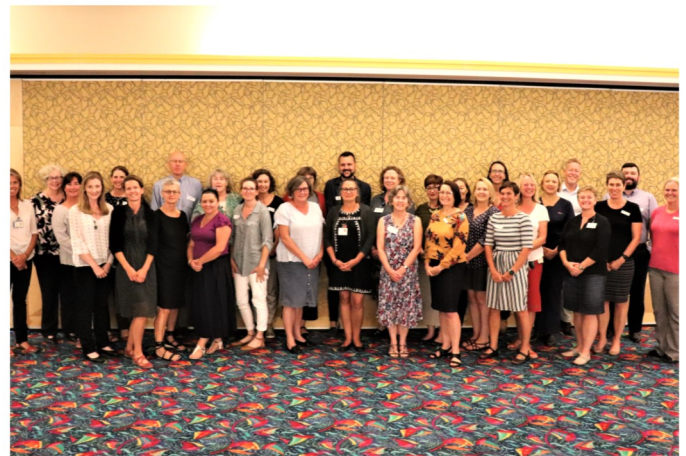
The Eurobodalla Medical Model of Care Workshop participants.