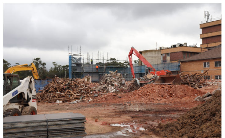
Clearing the way for the new four storey clinical services building.